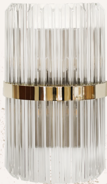
WALL LIGHT 9165.30

DIMENSIONS: H.35CM - Ø.100CM WEIGHT: NET 40KG BULBS: 24X G9 (MAX 28W) MATERIAL: BRASS & GLASS