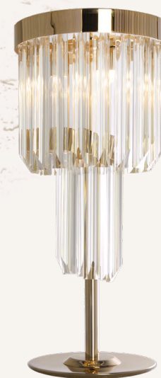
TABLE LAMP 9163.30

DIMENSIONS: H.56CM - Ø.40CM WEIGHT: NET 20KG BULBS: 6X G9 (MAX 28W) MATERIAL: BRASS & GLASS