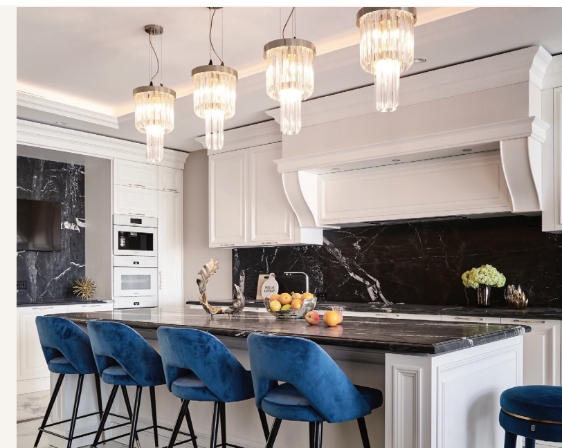
PROJECT BY: DOMOS DESIGN, RUSSIA

DIMENSIONS: H.50CM - Ø.30CM WEIGHT: NET 8KG BULBS: 3X G9 (MAX 28W) MATERIAL: BRASS & GLASS