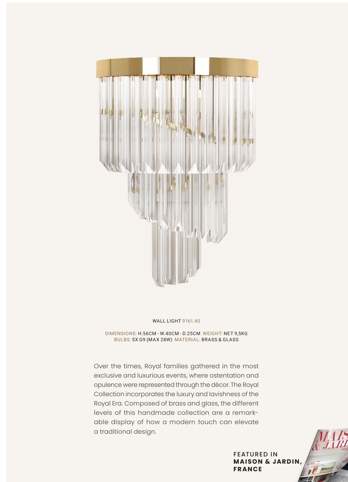
WALL LIGHT 9161.40